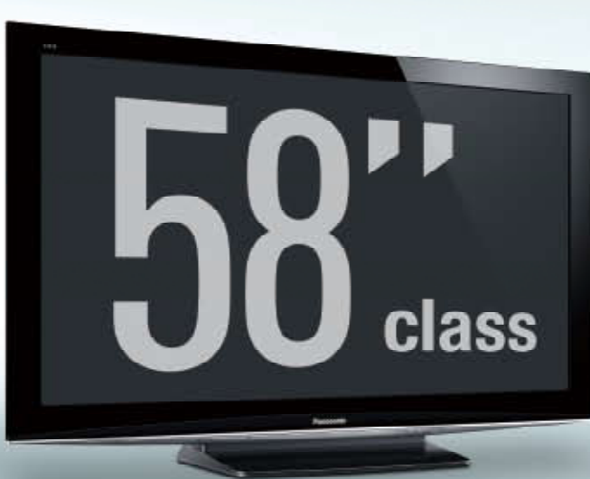
58.0 inches Measured Diagonally

58" Class Plasma HDTV (58.0 inches Measured Diagonally)