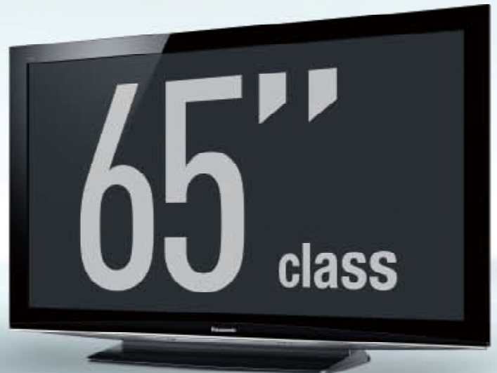
64.7 inches Measured Diagonally